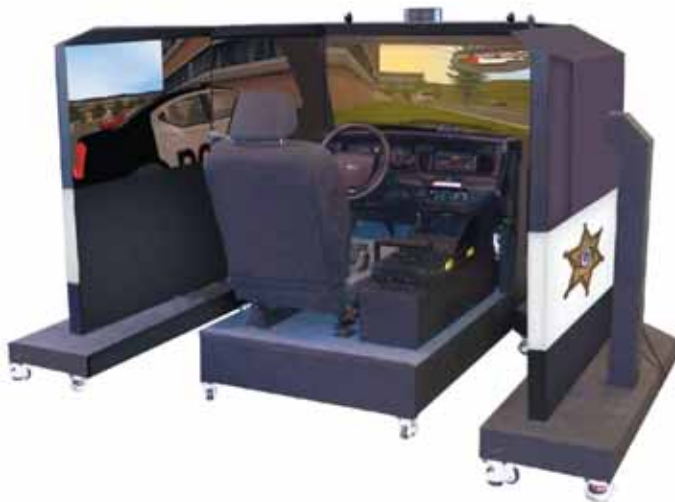
This sophisticated driving simulator is specially designed for law enforcement personnel.

and police car simulators for three-day evaluations in the City of Westland and Northville Township. A total of 165 firefighters and paramedics and 85 police officers went through driver training. The consensus was that they all benefitted by learning new techniques and reinforcing safe habits. In addition, many MMRMA member police and fire departments sent representatives to test-drive the simulation devices.