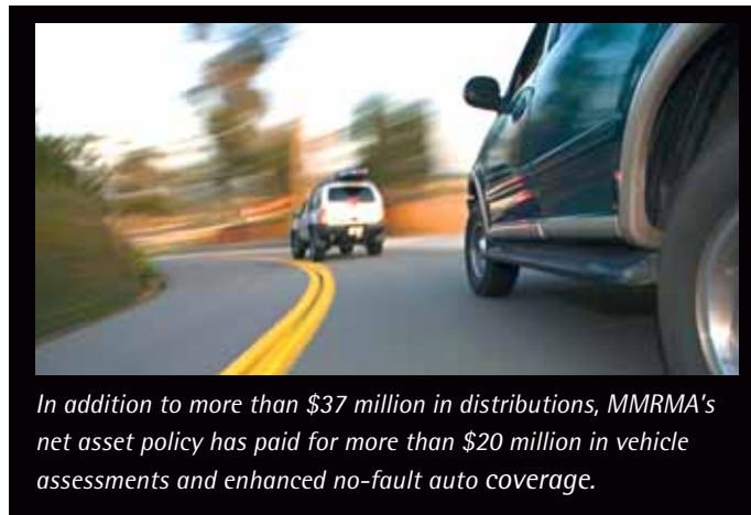
In addition to more than $37 million in distributions, MMRMA's net asset policy has paid for more than $20 million in vehicle assessments and enhanced no-fault auto coverage.